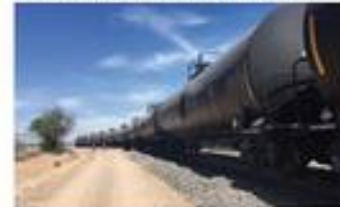
Unit train arriving at TCM