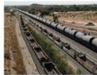
First unit train delivery Nov 2017